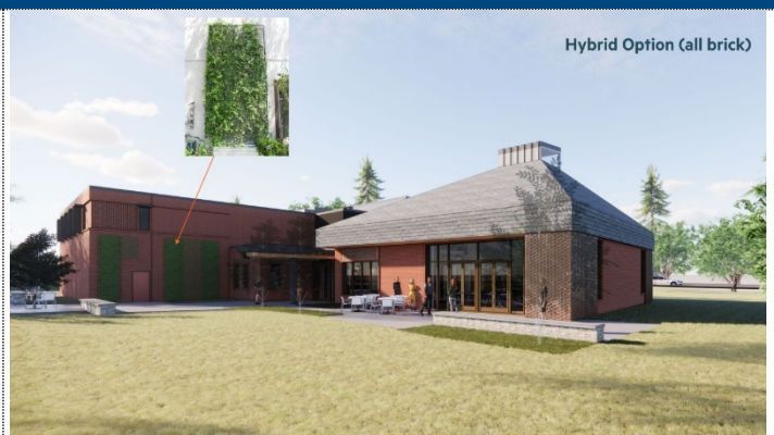
Construction Documents Phase – Exterior Update (Pavilion South) - November 8 th , 2021