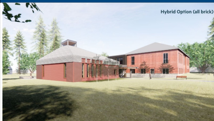
Construction Documents Phase – Exterior Update (Pavilion North) - November 8 th , 2021