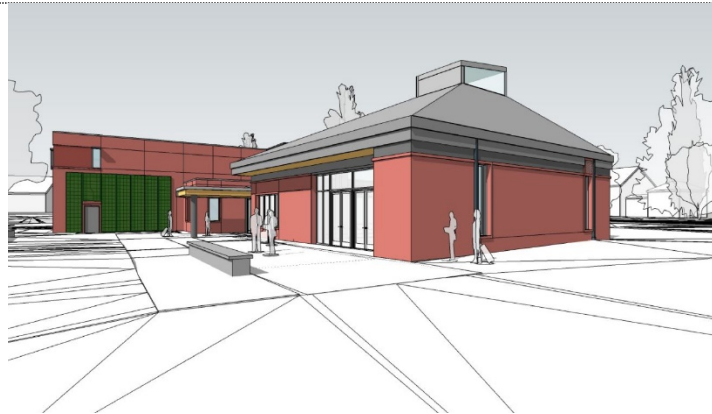
Construction Documents Phase – Pavilion Roof Edge - December 7 th , 2021