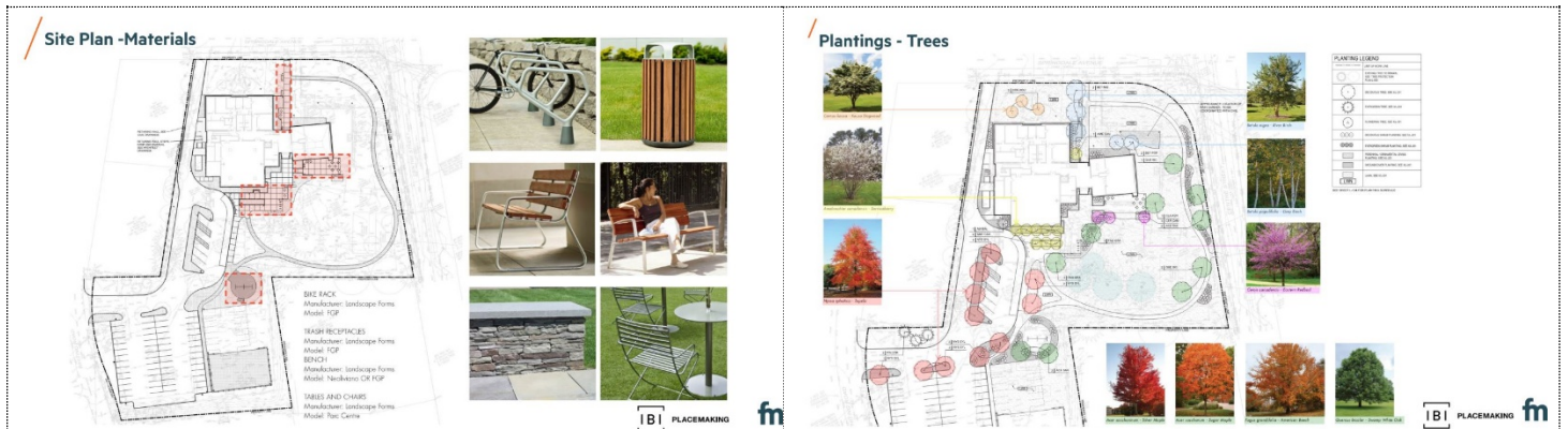
Construction Documents Phase – Site Plan (Materials) - November 22 nd , 2021