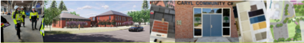
Caryl Community Center Club