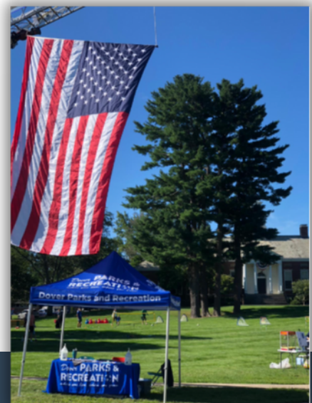
Grassy area outside a building with a tent, table, tree and american flag

Please contact bmcguire@doverma.gov with booth questions or concerns.