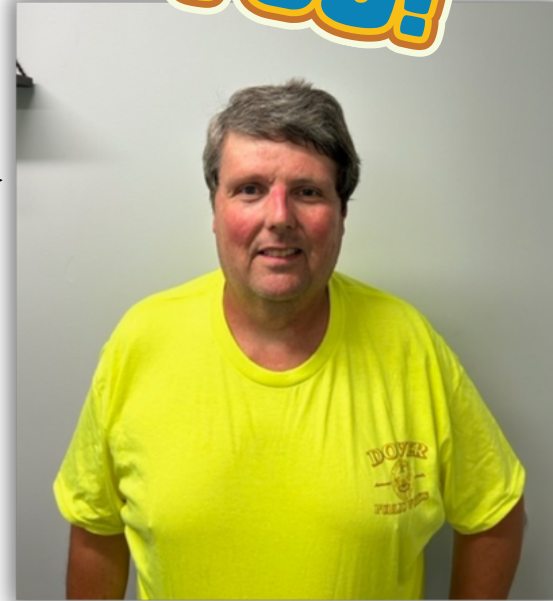
Man in neon yellow t-shirt