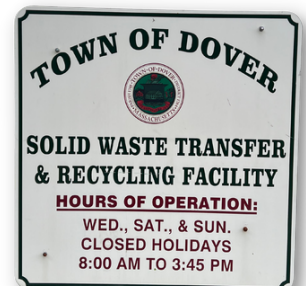
Town of Dover Transfer Station sign