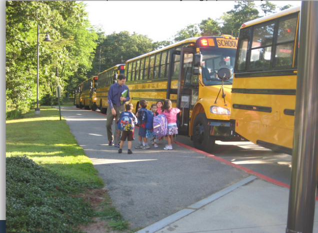
School buses lined up with teacher and young pupils stood by them

Chickering Elementary School is looking forward to welcoming students on Wednesday, Aug. 30. Kindergarten and preschool students will visit with their caregivers on that day and everyone else will join them for a full day. That's right: the buses are back. The school continues with its earlier start time, with doors opening at 7:35 a.m. and the day beginning at 7:50 a.m. Students are dismissed at 2:15 p.m. There will be about 480 students at Chickering in the fall, with four or five classes per grade and two integrated preschool classes.