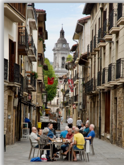
Group of people sat eating outside on street with church tower in background

Barry Pell is a world traveler and photojournalist. He has traveled widely over five decades, visiting and documenting landscapes and cultures in 170 countries on all continents.