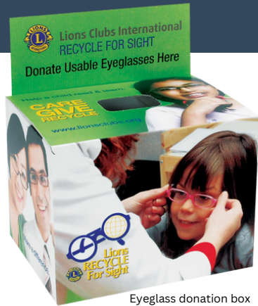
Eyeglass donation box