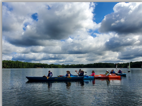
People kayaking on lake with blue sky and clouds

Get out on the water and have some fun! Enjoy a summer day on the pond in a kayak or canoe. Instruction and water safety guidance will be offered. Life jackets are provided. No experience necessary! We are also looking for volunteers to assist seniors on the water. Email Amee at atejani@doverma.gov if you're interested.