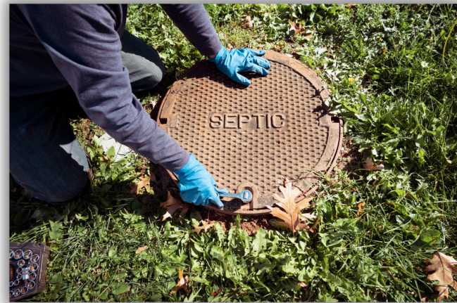
Person wearing blue gloves bending over and holding septic tank cover