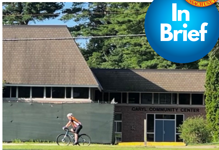
View through construction fence of building and cyclist going past the fence