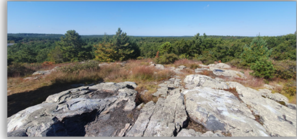
Large rocks with tree tops in distance

August 12th's guided walk will take you up Powisset Peak in Hale, and is again sponsored by Dover's Open Space Committee (OSC). There will also be an opportunity to visit the Powisset Farm Store (9 a.m. to 4 p.m.) before or after the stroll!