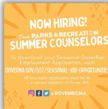
Now Hiring: Summer Counselors