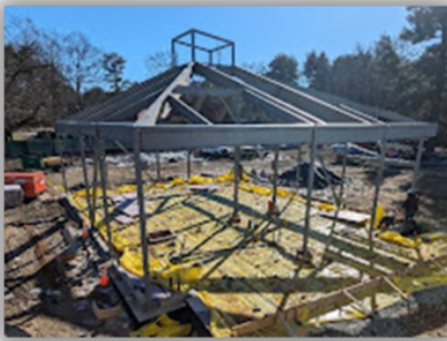
Pavilion building frame being constructed

For additional information, please visit the Building Committee updates page at https://www.doverma.gov/452/Community-Center-Building-Committee .