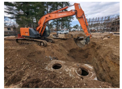
Removal of existing storm structures