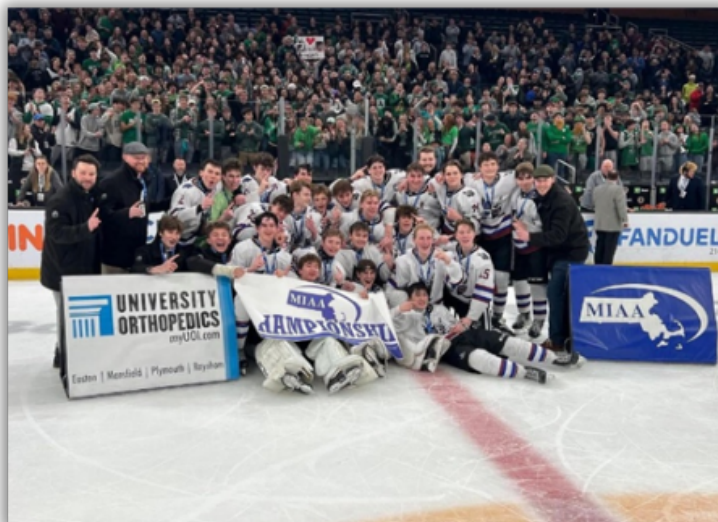
Boys Hockey Team Championship

Congratulations to all athletes on a terrific winter sports season!