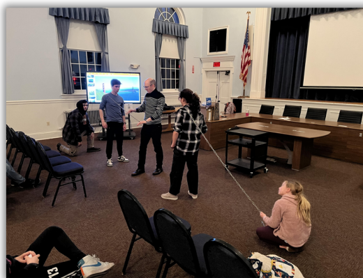
Structural Engineer Demo