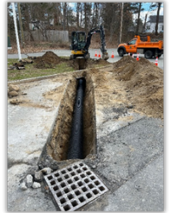
New Drainage Pipe

The Public Works team has been busy gearing up for this upcoming construction season. Crews have been working around the town garage campus. Replacing old corrugated corroded metal drainage pipe original to the E.F. Hodgson Co. facility. Replacing this failed infrastructure will help reduce the overall cost of the project (in the design stages now), and to provide a reliable and resilient drainage conveyance system at the Town Garage.