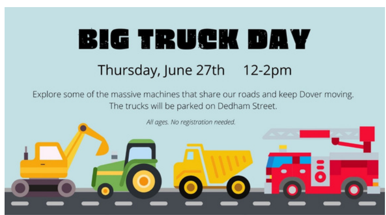
Big Truck Day