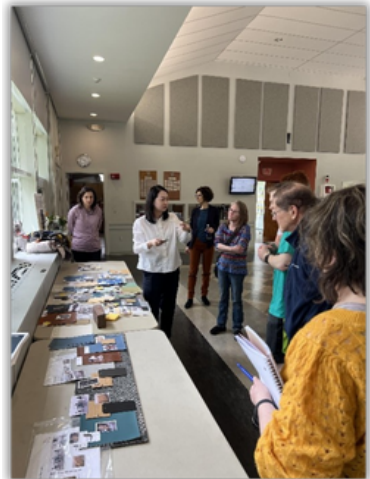
Students looking at fabrics and colors