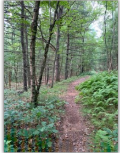
Wylde Woods Trail

Please join us for a guided walk, sponsored by the Dover Open Space Committee (OSC). We will walk through Dover's town-owned conservation land, Wylde Woods (aka the Centre Street Corridor). Come enjoy over 200 acres of your open space, enjoy the wooded trails and the rebuilt bog bridge! Walks will not be too strenuous but will be over uneven, rocky and possibly wet ground so wear appropriate footwear and bring walking sticks, binoculars and cameras as well as sunscreen, water & tick/bug repellent. Polite dogs on leash welcome. We will stroll in misty rain to shine. Parking information will be provided to registered participants on Friday morning and again early on Saturday.