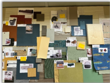
Selections for colors and fabrics