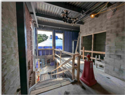
Second Floor Landing