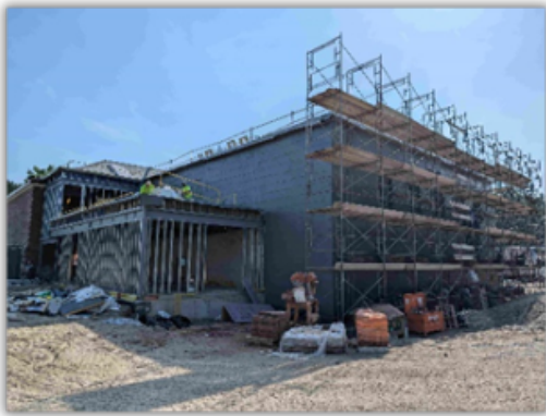
Gym and electrical room

Since our last update, we've had the biggest progress to date. With the structural steel and Pavilion slabs complete, the building envelope and interior trades were mobilized. The Pavilion building is now fully enclosed, and you can get a sense of what the open Community Room will feel like with the exposed wood roof panels, steel, cathedral high ceilings, and natural light from the light box. At the gym, the rough plumbing and electrical is complete. Roofing is well underway. At the 1910 building and the connector, the underground electrical and plumbing systems have been completed and the new concrete slabs were placed. This will allow interior framing followed by the rough electrical and plumbing, and HVAC activities to begin. Upcoming milestones include completion of the roofs and window installations. The site underground utility activities will commence after the July 4th holiday.