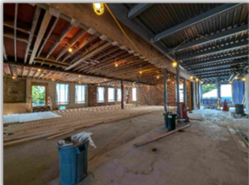
1910 and connected second floor