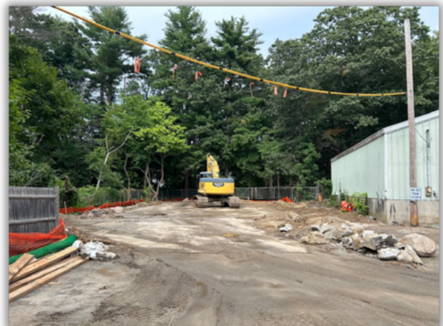
Demolished site of salt shed.