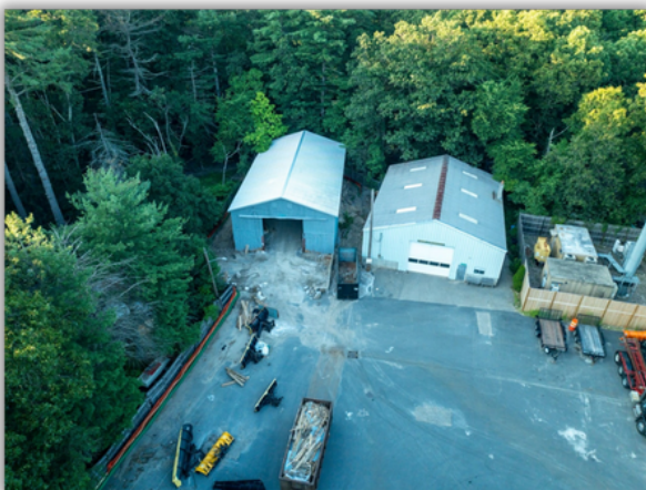
Pre-construction aerial view.

The DPW is excited to offer an update regarding the salt shed project. To reduce costs, the DPW staff are taking on several phases of this project including erosion controls, demolition, and subsurface excavation utilizing in-house resources. The shed has already been demolished and site work has begun. The bid opening for the building and installation occurred August 1st, with an anticipated start date of early September.