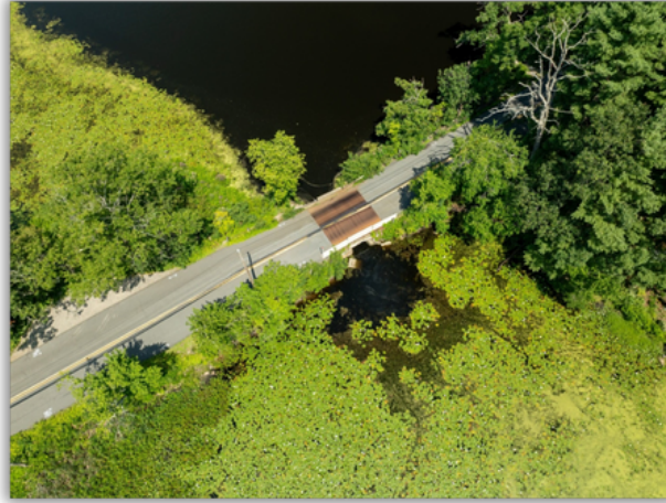
Pre-construction aerial view of culvert

The DPW is excited to announce the start of the reconstruction of the Willow Street culvert. The project is anticipated to begin installing erosion controls around August 1st, and then full roadway closure is anticipated to begin after August 5th. The culvert will be replaced with a precast concrete structure to provide a reliable and safe crossing for many years to come. The project will be sustainably completed within 120 days from the start date. The DPW appreciates your cooperation with the detour to complete this important project for the community.