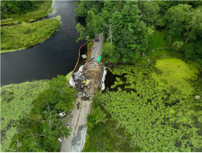
Demolition aerial view, Photo courtesy of DPD Drone unit.

The Willow Street culvert project is well underway. To date the old culvert was demolished and removed, followed by subsurface grade preparations. During the week of August 19th, the Construction team installed the precast footings and set the precast culvert. The next steps included setting the additional wing walls and backfilling and compaction around the culvert.