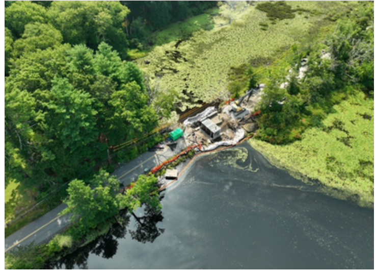
Construction aerial view, Photo courtesy of DPD Drone unit.