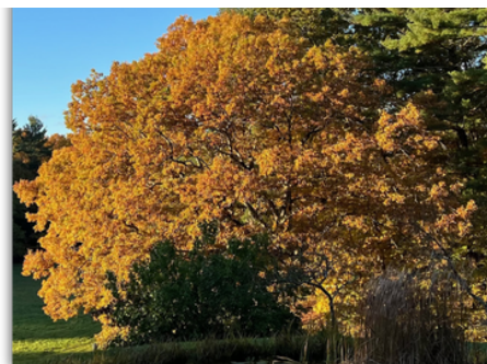
White Oak Fall