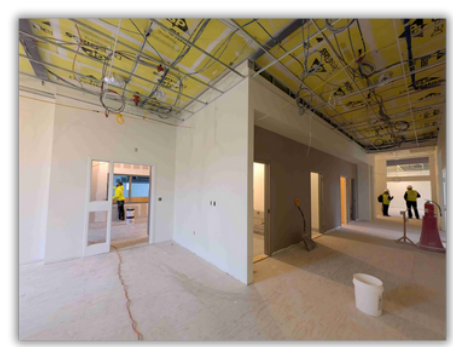
1910 Second Floor