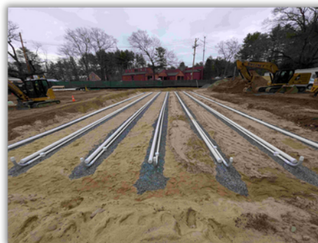
Septic System Progress