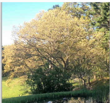
White Oak Summer

The Dover Tree Preservation Committee would like to highlight a common and beautiful tree in Dover: the White Oak ( Quercus alba ). This impressive tree can reach up to 150 feet tall and live for over 200 years. It is easily recognized by its rounded leaf tips, unlike the sharply pointed leaves of the Red Oak ( Quercus borealis ). Native to eastern North America, the White Oak provides excellent shade and is water-resistant, making it popular for bridge and dock construction as well as boat building. The acorns are an important food source for various birds and animals, including Blue Jays and squirrels. Currently, the leaves are falling, turning a lovely russet color. For more information about this and other New England trees, please click here . see below for pictures of a 130 year old white oak in each season.