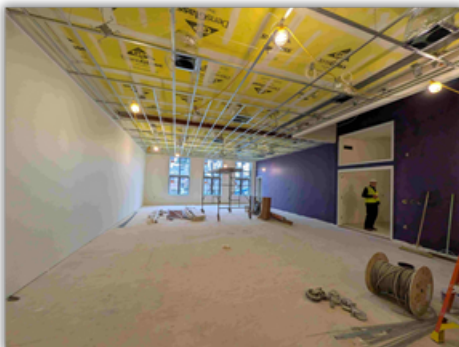
1910 Dance Hall