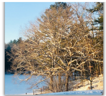
White Oak Winter