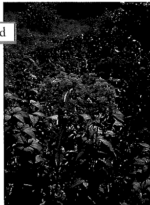
Joe Pye weed

Numerous professionals, including wetlands scientists and civil engineering firms, are available to help you identify wetlands resources on your property.